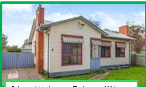
Before.... A blank canvas. The house in 2021.

A lot of energy had already been expended to remove a kikuyu lawn and large rocks from the back yard and a newly erected shed on the north-east back boundary --- destined to